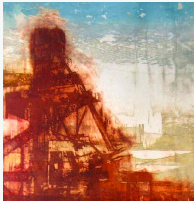
Joshua Parry, 'Growth and Destruction (detail)', etching, 99 x 39 cm